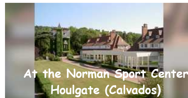
At the Norman Sport Center Houlgate (Calvados)

Workshops of dances from Bulgaria Macedonia Serbia And songs from the Balkans